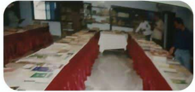
Book exhibitions, seminars, lectures and library journals publications.