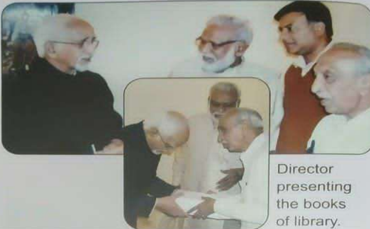
Director presenting the books of library.

Hon. Vice President of India, his excellency Hon. Dr. Abdul Hamid Ansari