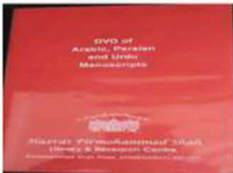
CDs and DVD of Arabic, Persian and Urdu Manuscripts